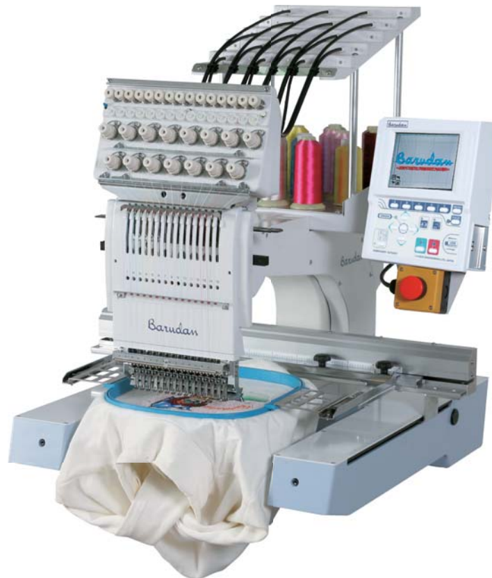
Elite Pro II - BEVT-Z1501CBII