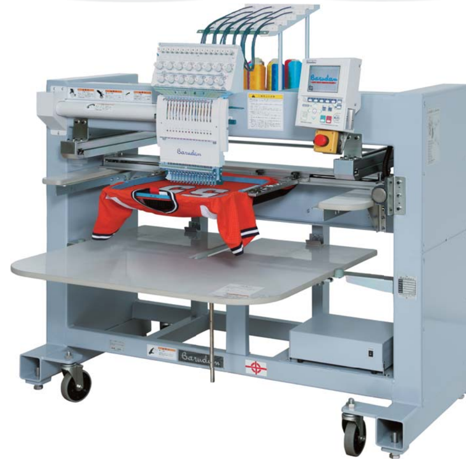
C01 Bridge Machine - BEVT-Z1501CII