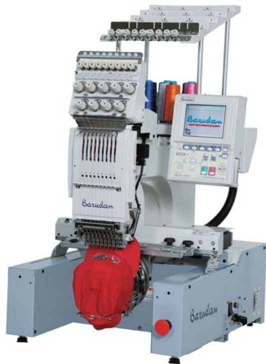
Elite XL - BEVT-Z901CA