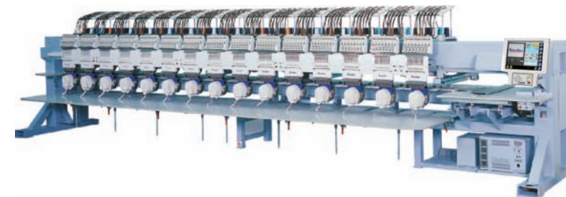
15-Head - BEKS-S1515C