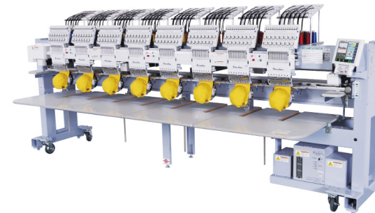
8-Head - BEKY-S1508CII