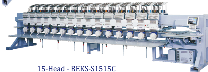
15-Head - BEKS-S1515C

Heavy-duty, steel construction provides stability and minimum vibration resulting in superior stitch quality. Designed to be compact and powerful, our machines will fit through most standard doors so you can set up shop almost anywhere.