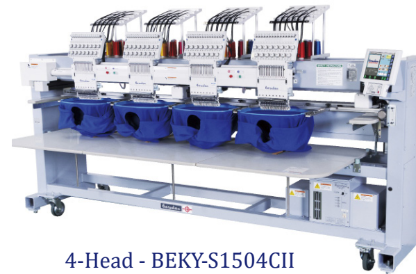
4-Head - BEKY-S1504CII