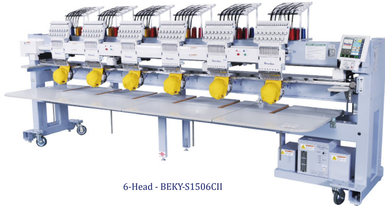
6-Head - BEKY-S1506CII

QUALITY & POWER - SUPERIOR STITCH QUALITY